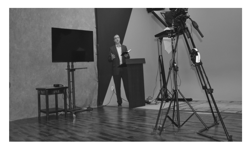
Luther Rice is committed to pursuing technological innovation in all aspects of the Institution. Online courses contain video lectures created by Luther Rice professors in our custom video studio on-campus.