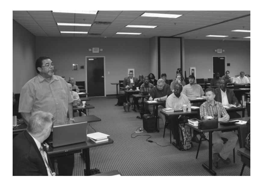
Doctor of Ministry module class meeting on campus in Woodlawn Hall.