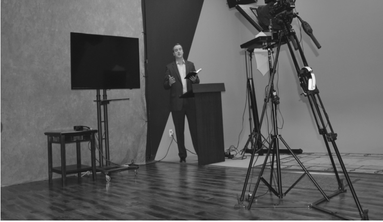
Luther Rice is committed to pursuing technological innovation in all aspects of the Institution. Online courses contain video lectures created by Luther Rice professors in our custom video studio on-campus.