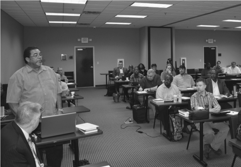
Doctor of Ministry module class meeting on campus in Woodlawn Hall.