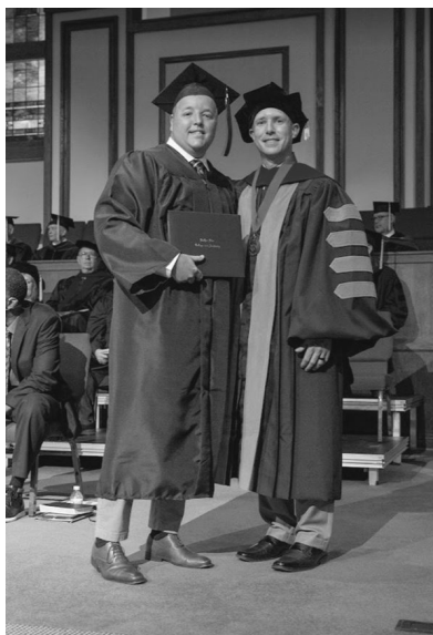
A graduate receiving his diploma during commencement ceremonies, held annually at First Baptist Church, Conyers, Georgia.

These Master of Arts programs are limited in their development of students preparing for ministry as a pastor. Pastoral candidates are encouraged to enroll in the Master of Divinity program. Those who are considering pastoral ministry may benefit from earning one of these specialized degrees prior to entry into the M.Div. Transfer of the credits is possible, subject to the limitations for the program of study. The Master of Divinity degree is designed to provide a broad base of knowledge to fit the needs of students preparing for a lifetime of ministry. The M.Div. may be earned entirely online or by a combination of both online and on-campus classes.