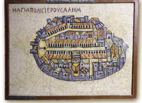
The Madaba Mosaic Map section is the oldest surviving original cartographic depiction of Jerusalem, dated to the 6th century A.D.

For more information on discoveries in the Holy Land, visit the Israel Antiquities Authority website.